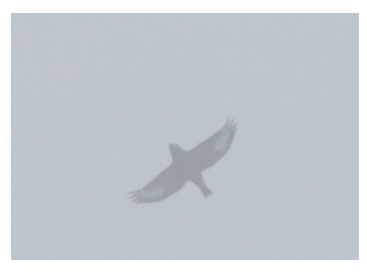
Hawfinch, Harden, nr Penistone, W Yorkshire, Oct 2017.